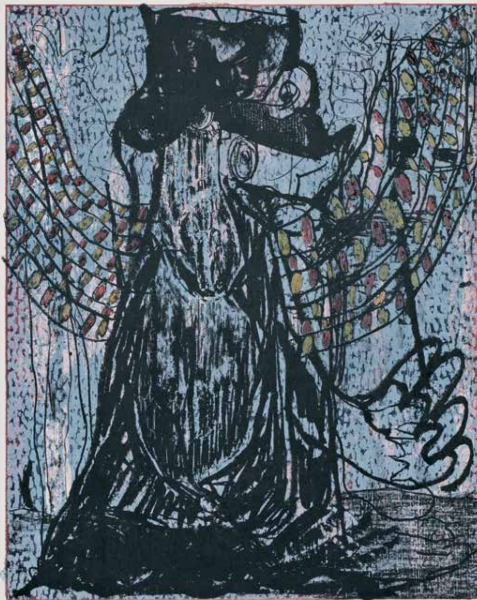
Armageddon Days are here Again, 2012

Edition: 10 + 2. A.P. 64 cm x 51.5 cm 6-colour lithograph Printed by Ulrich Kühle